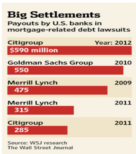
FIGURE 2: RECENT US BANKING SETTLEMENTS