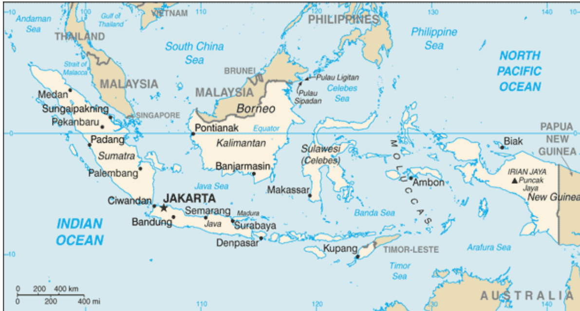
FIGURE 1: POLITICAL MAP OF INDONESIA