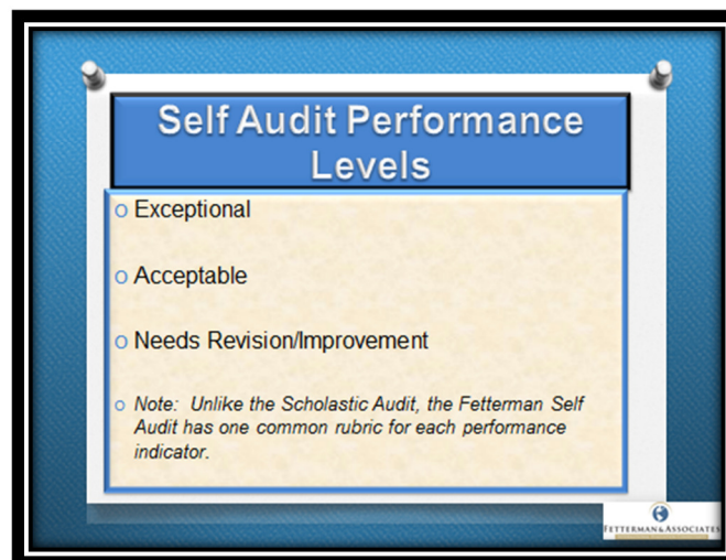
Figure 2: Self Audit Performance Levels

In order to simplify results and create a more cohesive understanding, the following rubric is used for documenting opinions on the implementation of the Eleven Indicators of Effective Schooling. The Common Rubric is explained in Figure 2 .