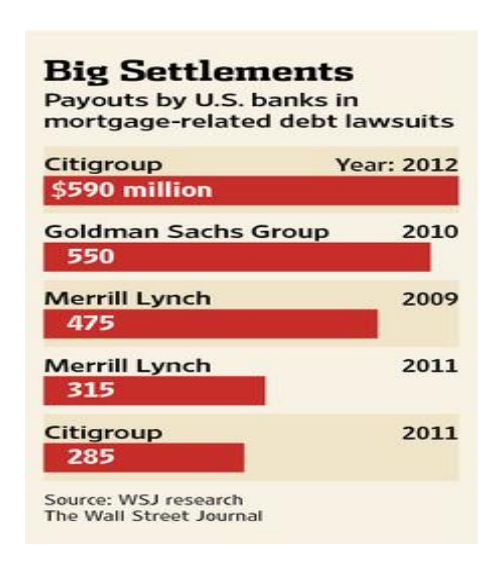
FIGURE 2: RECENT US BANKING SETTLEMETNS