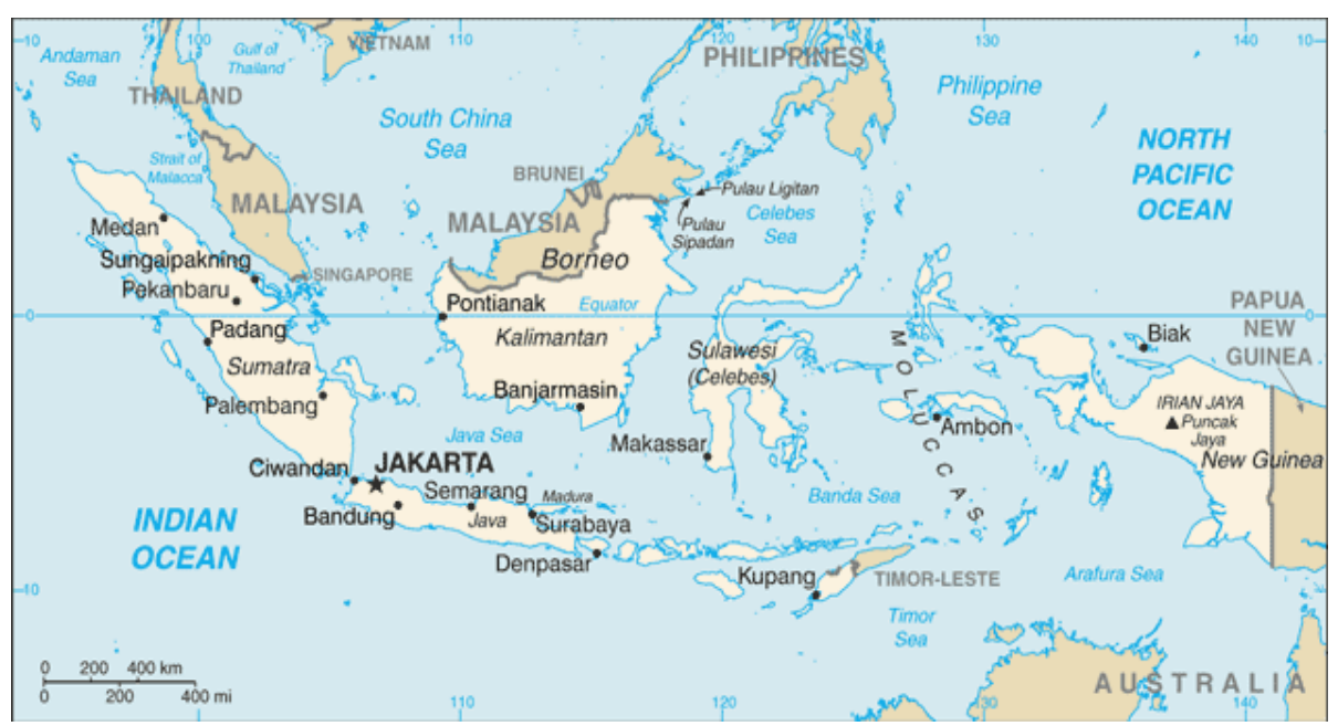
FIGURE 1: POLICTICAL MAP OF INDONESIA