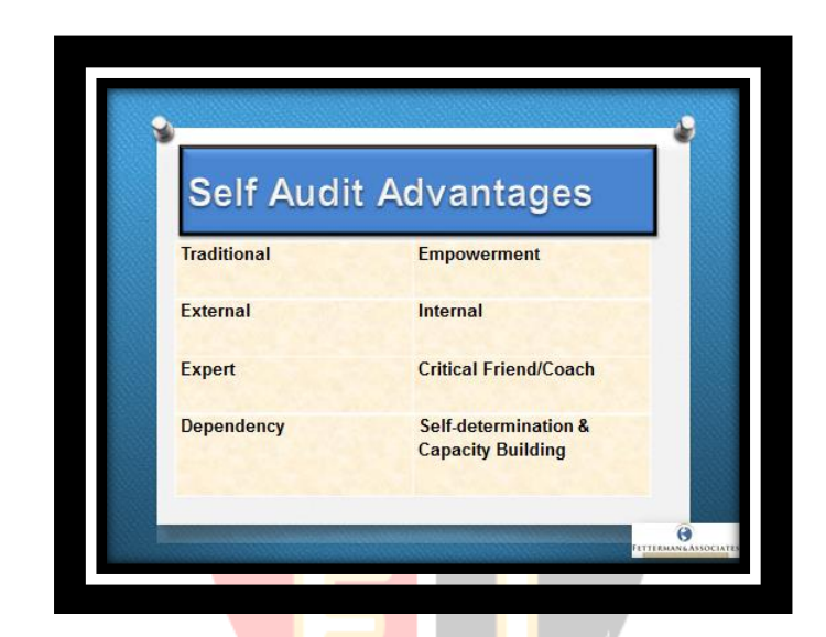
Figure 4: Empowerment Self Audit Advantages

The Guided Empowerment Self-Audit panel conducts an introductory meeting with the principal, in order to establish common expectations for the two-day visit. During this time, the advantages and the overview of activities of the Guided Empowerment Self-Audit are discussed with the principal. The principal provides the panel with the Portfolio: school profile, school maps, and names of staff members. The team notifies the principal how each staff member will be able to participate in the Guided Empowerment Self-Audit process during the empowerment session at the end of the school day.