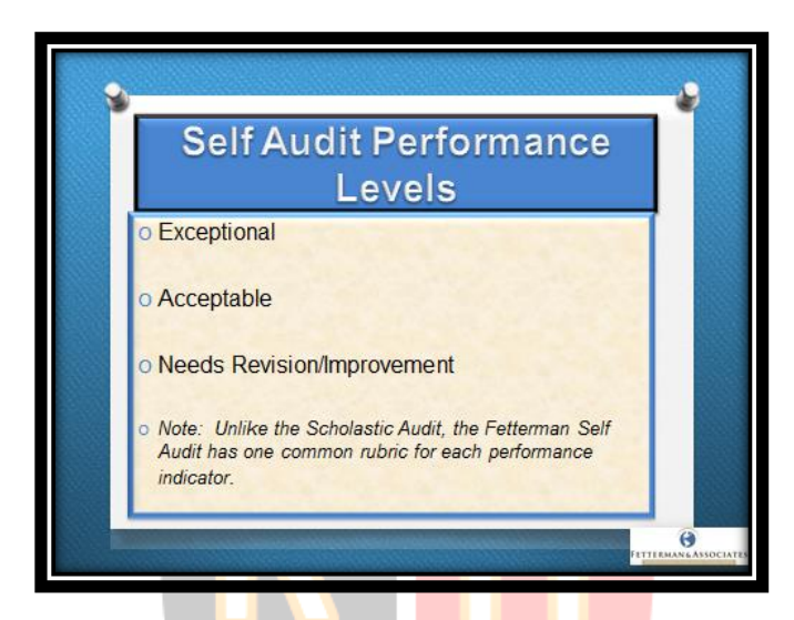
Table 2: Common Rubric and Benchmarks