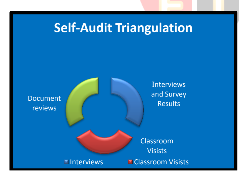
Figure 1: The Triangulation of Data

The Empowerment Self Audit report is based on a triangulation of data gathered from perusal of documents, observations, interviews, and completed perceptual survey results as depicted in Figure 1 below.