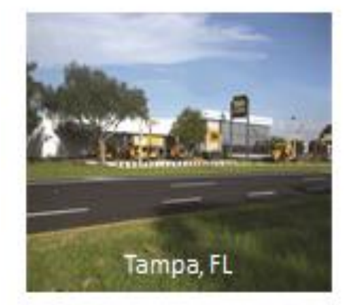
Figure 3 Yale Lift Trucks Locations

Journal of Business Cases and Applications Volume 12 - October, 2014