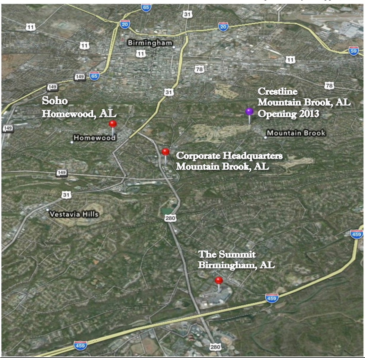
Maps courtesy of Apple, Inc.