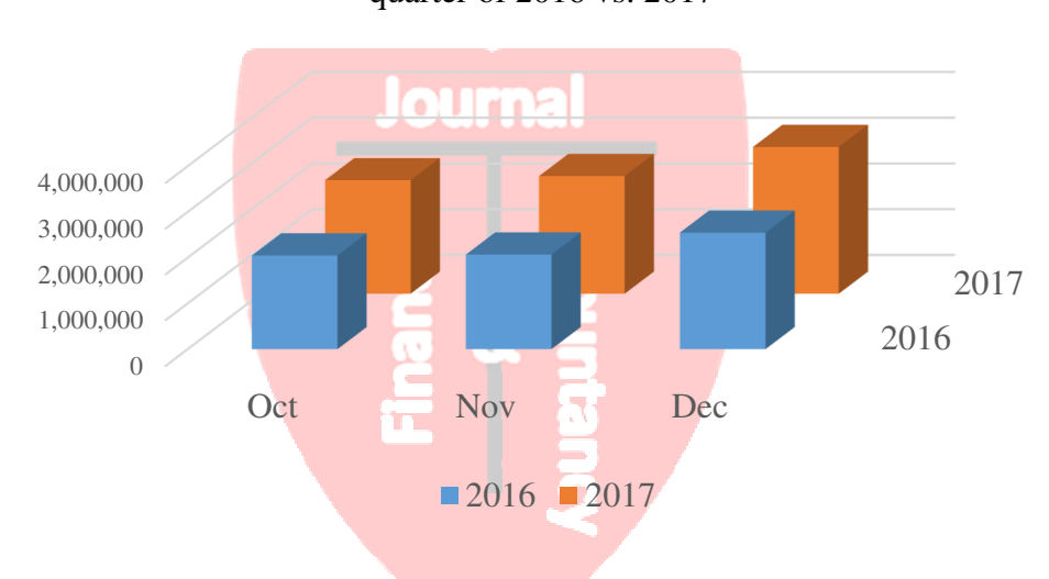
Chart 2. Collected sales tax in Jefferson county, 4th quarter of 2016 vs. 2017

Sales tax collected increased by $1,599,964 (24%) in the 4<sup>th</sup> quarter in 2017 as compared to the 4<sup>th</sup> quarter of 2016 (Chart 2). This increase represents an unplanned additional expenditure of $319,992,800. This increase was due to residents having to replace items lost due to Hurricane Harvey. Research also observed a significant increase in sales in a local hardware store in Southeast Texas. In the 4<sup>th</sup> quarter of 2017, sales increased by 66.7% in their Beaumont store, 173.2% in their Lumberton store and 124.1% in Vidor store (Table 6).