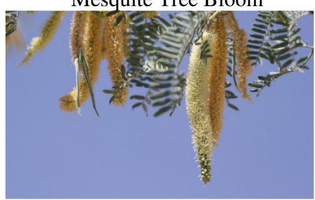
Figure 4 Mesquite Tree Bloom

https://gardenerdy.com/facts-about-mesquite-trees/