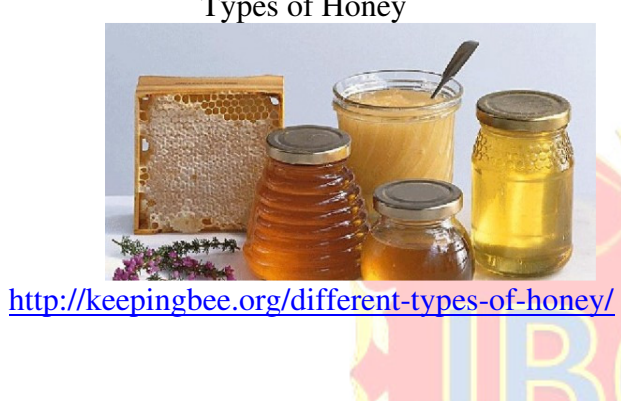
Figure 5 Types of Honey

https://gardenerdy.com/facts-about-mesquite-trees/