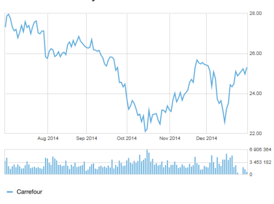
Figure 3: Carrefour Stock Price Trend, July to December 2014 Stock trend history